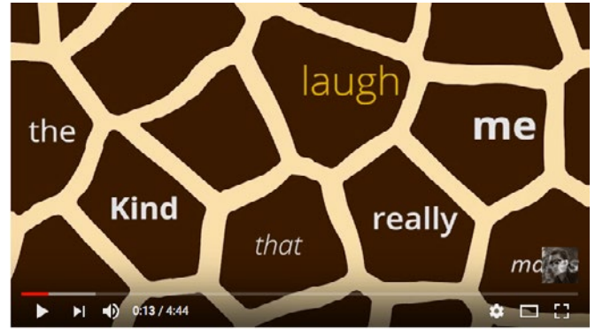
GIRAFFE (Lyric Video), The Rise of the Zugebrian Time Lords

Now 53 and living in Italy with his wife and two children, Maitreya keeps up a pretty active website at sanandamaitreya.com and grab your copy of The Rise of the Zugebrian Time Lords at iTunes . ■