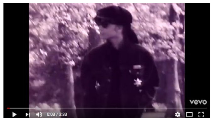
For old time's sake, let's listen to "Wishing Well" one more time