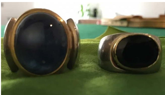
Sananda Maitreya's rings: "They assist me in getting my 'work mind' together and getting the work done."

We rarely get to write out things anymore because we use our digital instruments so much, but some processes need a more immediate, visceral approach. Writing with my fingers on a pen seems to bring me closer to my heart, with much less second-guessing.